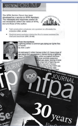
Above: Four Member Forum features in the NFPA Journal in 2007-2008.

Below: IFMA Industry News, Jan. 2008, U.S. Engineering Press Review, Jan. 2008, NEC Plus Newsbriefs, Jan. 2008, VA-Pilot, Sept. 2007.